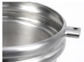
Standard or Smiley-Face TR hole in BFM® Spigot